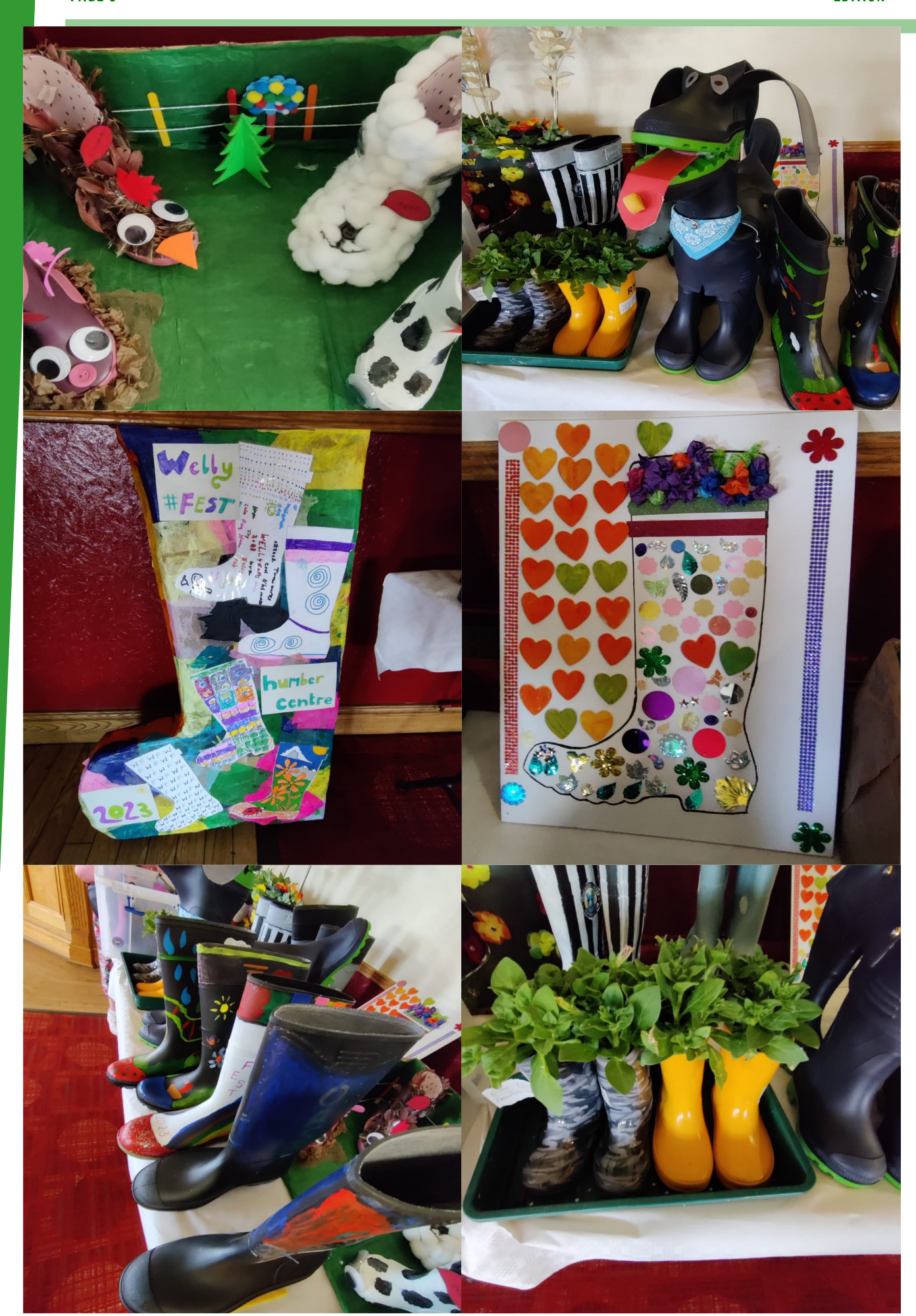
Collaboration. Hope. Encouragement. Empowerment. Respect. Support. Fun Www.yorkshireandhumberinvolvementnetwork.nhs.uk